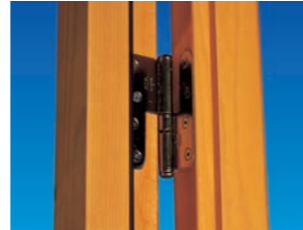
All doors are hung on heavy duty steel hinges for extra security

Each mortice and tenon door is hung on heavy duty steel hinges. The door and frame are rebated and secured with a 3-point locking system. They are also security glazed. This combination gives a high level of resistance to forced entry.