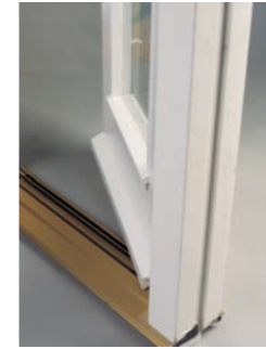
High performance low level weather bar (Open in door)

Letter plates can also be supplied upon request.