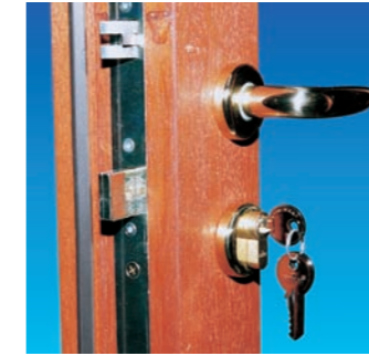
Standard handle and locking mechanism