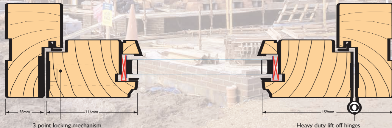
Horizontal Section (Open in door)